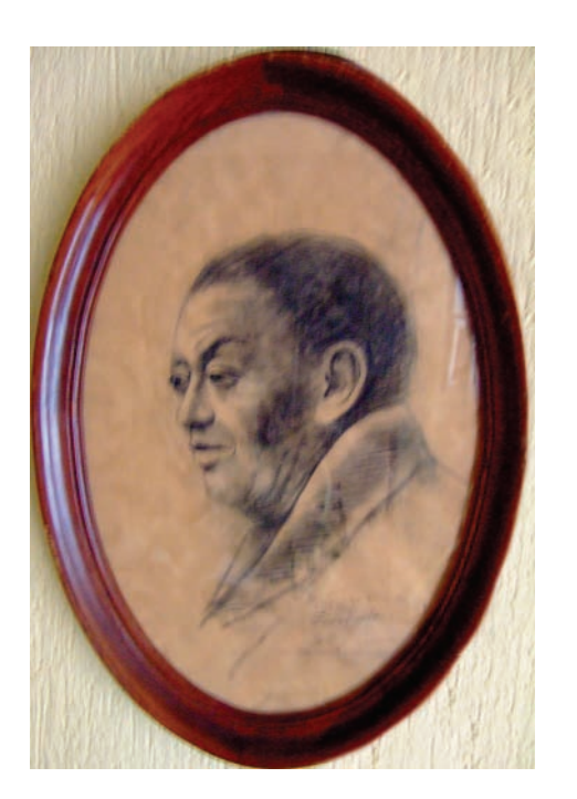
FIGURE 6. Drawing of Diego Rivera. Noyola Collection. Pencil on paper. 19 1/2" x 13 3/4" (50 x 35 cm). The attribution to Frida Kahlo is questioned.

Martin's theory is that there is a workshop of at least several people that created the archive. "The perpetrators have constructed all these letters, poems, drawings and recipes, using Frida's biography and her published letters as a roadmap," she wrote this author before the