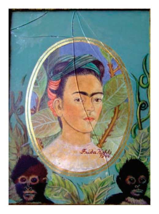
FIGURE 3. Woman with Monkeys . Oil on canvas with glass. 31 x 22 cm. Noyola Collection. The attribution to Frida Kahlo is questioned.

in recent decades, but nothing quite like the massive cache that emerged last year in Mexico. The "rediscovered" material includes more than 1,200 items — oil paintings, drawings, diaries, letters, painted boxes and ephemera. The owners characterize it as an archive assembled by Frida Kahlo, but the entire collection has been roundly rejected by the established authorities on the artist's life and work, although other people have spoken out in favor.