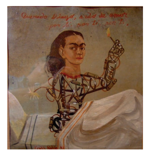
FIGURE 5. Woman with Firecrackers . Oil on cardboard. 35 x 31 cm. Noyola Collection. The attribution to Frida Kahlo is questioned.

Frida-headed deer ( FIG. 4 ) — "is not Kahlo's painting because the concept of the work as well as its execution were invented by someone who does not understand the depth of her iconography."