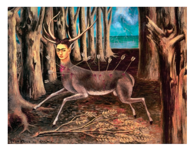
FIGURE 2. FRIDA KAHLO, The Little Deer , 1946. Oil on masonite. 8 7/8" x 11 3/4" (22.5 x 29.8 cm). Private collection. © 2010 Banco de México Diego Rivera y Frida Kahlo Museums Trust.

in recent decades, but nothing quite like the massive cache that emerged last year in Mexico. The "rediscovered" material includes more than 1,200 items — oil paintings, drawings, diaries, letters, painted boxes and ephemera. The owners characterize it as an archive assembled by Frida Kahlo, but the entire collection has been roundly rejected by the established authorities on the artist's life and work, although other people have spoken out in favor.